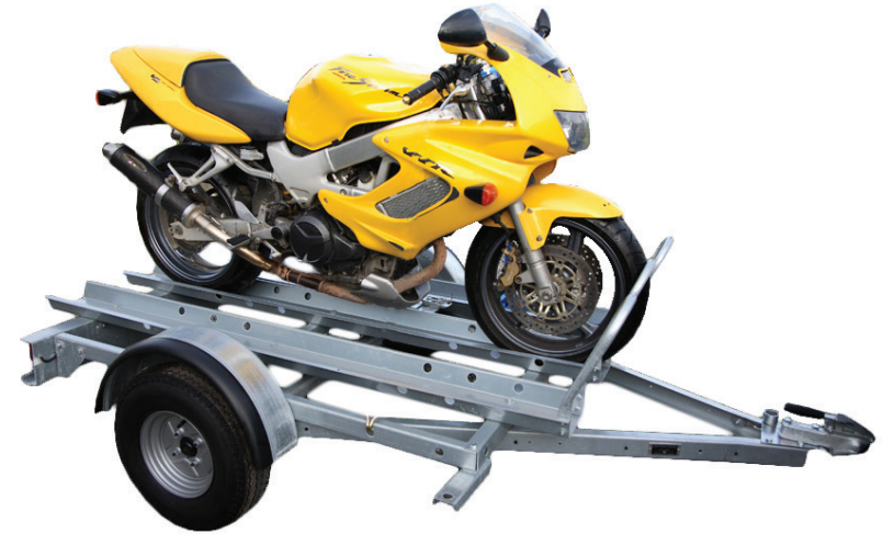
Triple Runner 500kg