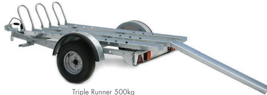
Triple Runner 500kg